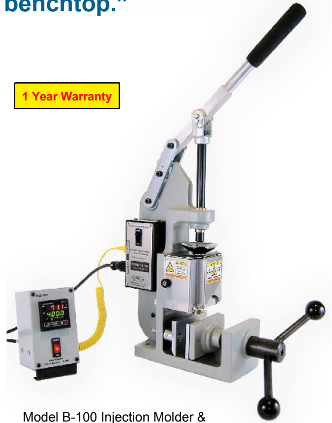
Model B-100 Injection Molder & ECB-001 controller